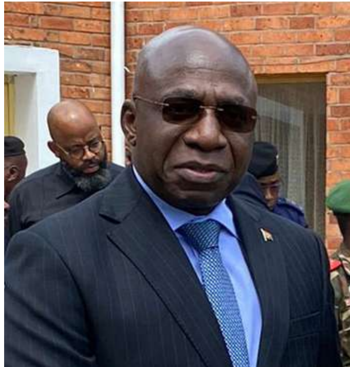
H.E Tête António Minister of External Relations