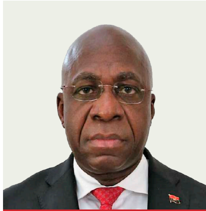
H.E Tété António Minister of External Relations

T he Angolan diplomacy celebrated on 12 November, the Angolan Diplomat's Day, a fact that honors with satisfaction the national cadres that throughout the years, have been committed and engaged in the pursuit of the strategic objectives of the foreign policy of the Republic of Angola.