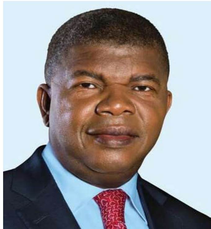
H.E João Manuel Gonçalves Lourenço President of the Republic of Angola

The cities of Kigali and Kinshasa , capitals of Rwanda and the DRC respectively, received on 11 and 12 November , the visit of His Excellency João Manuel Gonçalves Lourenço , President of the Republic of Angola, who travelled to these countries as part of the diplomatic efforts undertaken, as mediator , to ease the prevailing tension between the Republic of Rwanda and the Democratic Republic of the Congo .